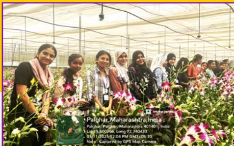
Coconut Valley, Kelwa