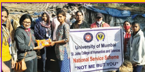
NSS Activity (Tree Plantation)