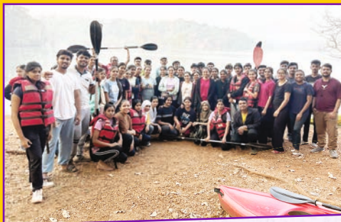
Khopoli and Kolad