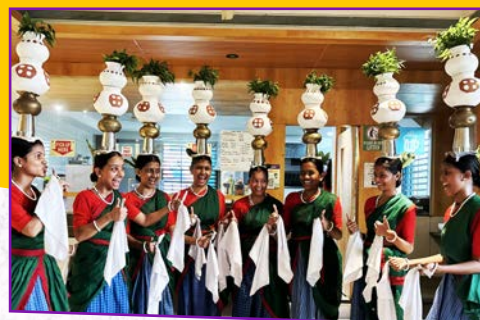
Youth Festival 2024