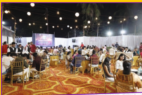
Theme Lunch: Zaika -E-Kashmir