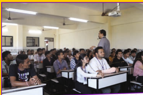
Rubicon: Skill Development Session