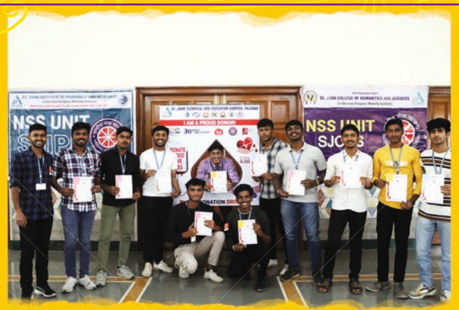
Blood Donation Drive